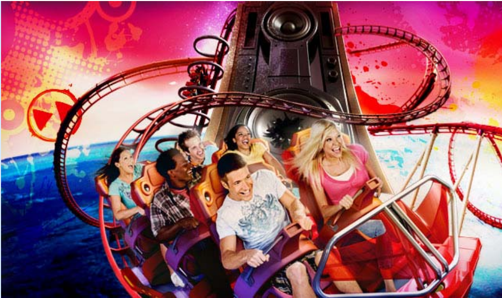
Hollywood Rip Ride Rocket—Universal Studios

36 days till we leave for Disney World. Check out the countdown clock at mhsbands.org .